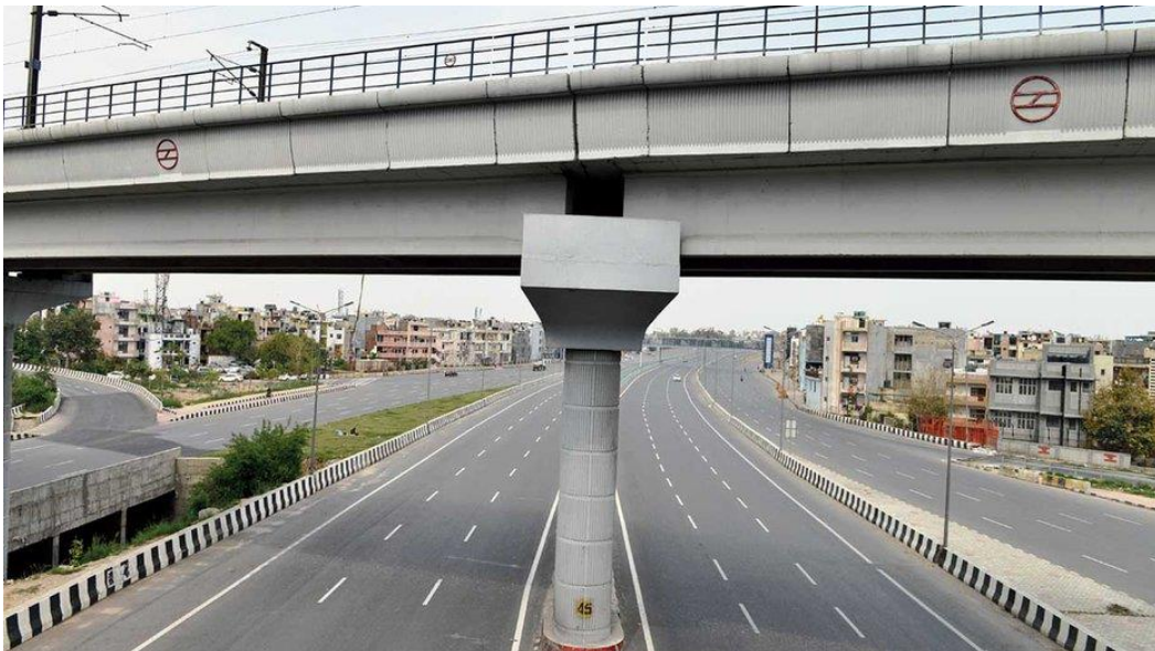
The Delhi-Meerut Expressway during the lockdown in New Delhi on Tuesday.

March 22nd, 2020: Janata curfew day in India. My cellphone rings at 7am. A friend is calling. There is anger in his voice.