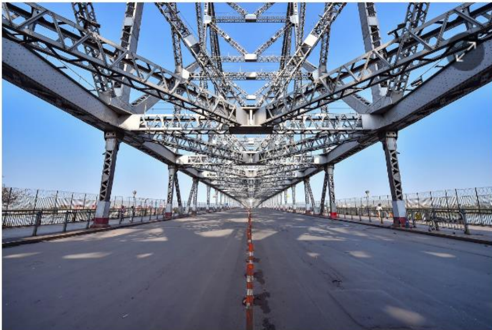
Howrah bridge wears a deserted look during Janata curfew in the wake of coronavirus pandemic, in Kolkata, Sunday, March 22, 2020

There are two major reasons why nCoV has spread so widely and rapidly. An infected person does not show any symptoms of disease for the first three or four days. This person, therefore, is unaware of being infected and does not restrict interacting with others who are possibly uninfected. These uninfected persons then become infected.